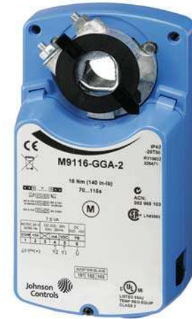
M9116 Series Electric Non-Spring-Return Actuators

An anti-rotation bracket prevents lateral movement of the actuator. Pressing the spring-loaded gear release on the actuator